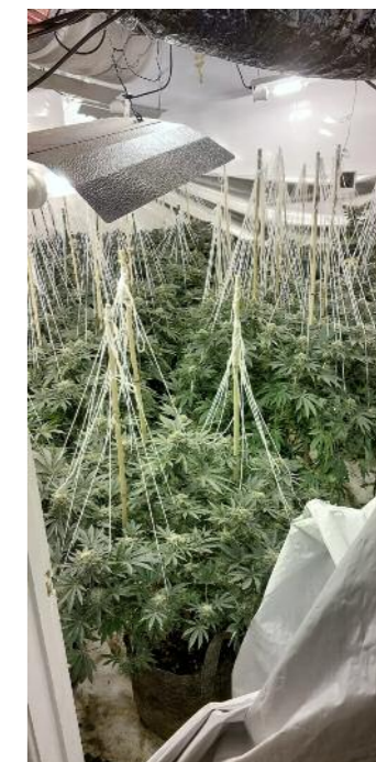
A cannabis factory recently shut down by Surrey Police

"Drug dealers often rely on young people to 'run' drugs for them, to avoid the risk of arrest themselves. They recruit children by giving them money and expensive items like phones or trainers. If a child you know has acquired several expensive items and their behaviour has become more withdrawn and secretive, they could be at risk of exploitation.