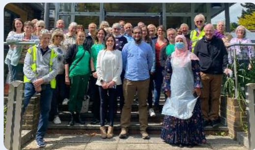
Volunteers outside United Reformed Church vaccine centre

FastHeal Pharmacy is still operating a vaccination service from United Reformed Church, White Rose Lane. Now offering vaccinations to children as young as five years old (by appointment only), the centre is open Mondays, Wednesdays, Thursdays, Fridays and Saturdays, between 9am and 5pm.